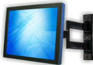
WallMount Ready with VESA Pattern 100x100mm 200x200mm