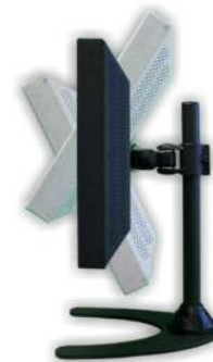
Optional Table Base Stand

For more information email us at: sales@dynics.com