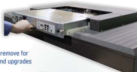
Easy to remove for service and upgrades