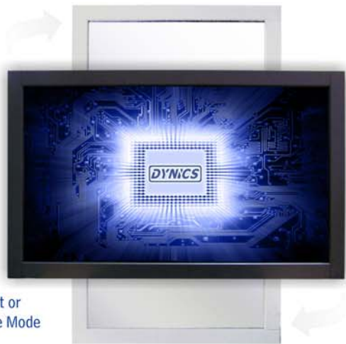
Portrait or Landscape Mode

The PX Series is a family of large screen LCD monitors with integrated Touch Screens designed for all types of operation. The PX Series incorporates unique features and robust design elements providing a durable solution suitable for high traffic applications.